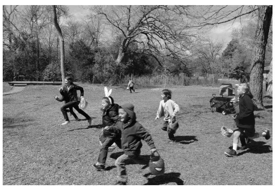
2013 Egg Hunt